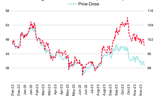
Mega Lifesciences PCL (MEGA TB)